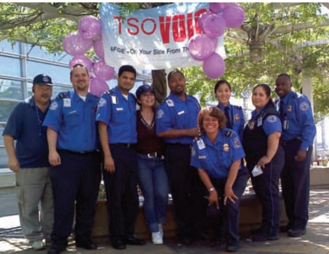
Old and new AFGE members at National Airport in Washington, D.C.