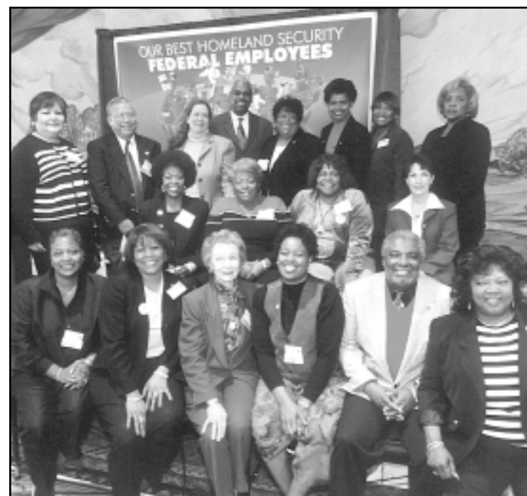
Turn to page 6 for more photos from the 2002 AFGE Legislative & Grassroots Mobilization Conference.