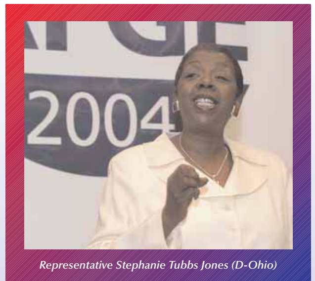
Representative Stephanie Tubbs Jones (D-Ohio)